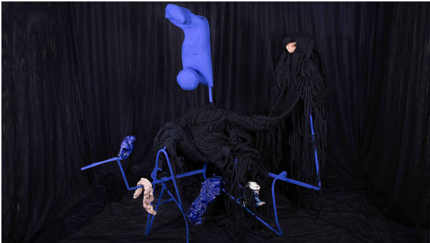
Sonja Gerdes, 'Pie of Trouble. Let's hang. Air for free. Hyperamorph.' (Courtesy of the artist and CLOACA PROJECTS)

By Sarah Hotchkiss (https://ww2.kqed.org/arts/author/shotchkiss/) 🐦 (http://twitter.com/sahotchkiss)